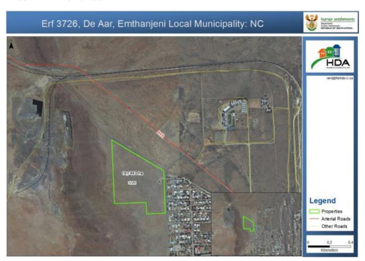
FIGURE 1: ERF 3726 LOCALITY MAP

In accordance to the Emthanjeni land use management scheme the property (erf 3726) is zoned agricultural I. Currently there are no activities occurring on the property as it is predominantly vacant, however there is an unkempt building around.